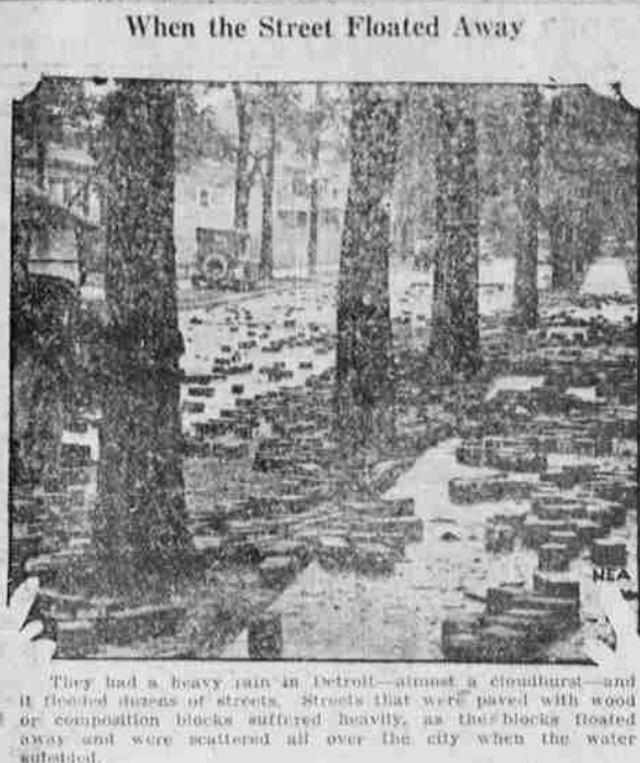
When the Street Floated Away They had a heavy rain in Detroit—almost a cloudburst—and it flooded dozens of streets. Streets that were paved with wood or composition blocks suffered heavily, as the blocks floated away and were scattered all over the city when the water subsided.