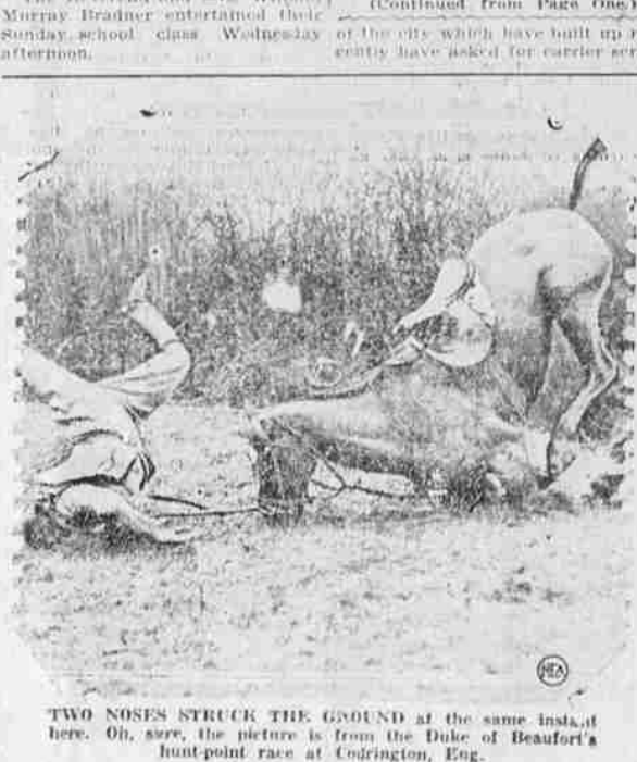
TWO NOSES STRUCK THE GROUND at the same instant here. Oh, yes, the picture is from the Duke of Beaufort's hunt-point race at Cudington, Eng.

STATISTICS SHOW GAIN IN RECEIPTS (Continued from Page One.) of the city which have built up recently have asked for carrier ser-