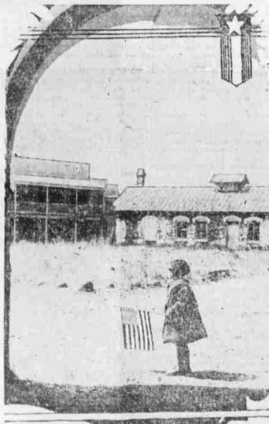
OVER THIS OLD FORT the American flag "still waved" when British guns roared their bombardment. And it was the sight of the flag that inspired Francis Scott Key to write the national anthem, "The Star Spangled Banner." Now the place is to be restored as a shrine. Have you forgotten the name? Fort M'Henry, near Baltimore.