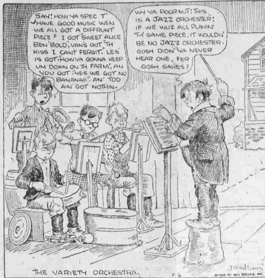
THE VARIETY ORCHESTRA.