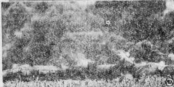
One cigaret, price, $250,000. Twenty-three tank cars went off the track of the Midland Valley railroad at Haskell, Okla. Someone lighted a cigaret, dropped the match—and look what happened.

development fund for the past two years, and general secretary of the Oregon State Chamber of Commerce over a period of several months, has been chosen as manager of the new financing company.