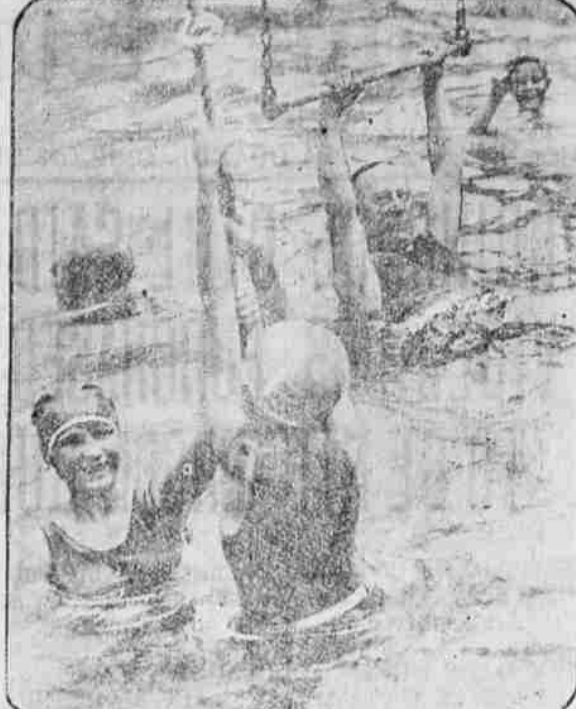
Al Smith, governor of New York, stuns a few moments from his duties to spend the week-end with his family at Monmouth Beach, N. J.