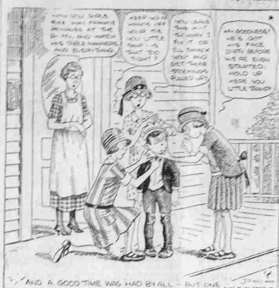
AND A GOOD TIME WAS HAD BY ALL - BUT ONE