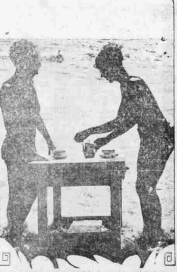
MOONLIGHT TEA PARTIES in the surf is one of the latest things along Southern California's beaches. A shimmering moon overhead and a cooling sea beneath makes the affair quite enjoyable.