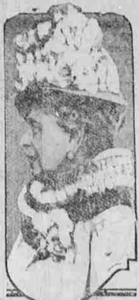
QUEEN MARY'S OWN particular style of hat and gown is shown by this picture. Unlike her son, the Prince of Wales, the queen does not seem to care about starting a fashion craze. Picture taken a few weeks ago at the opening of a $5,000,000 road out of London.