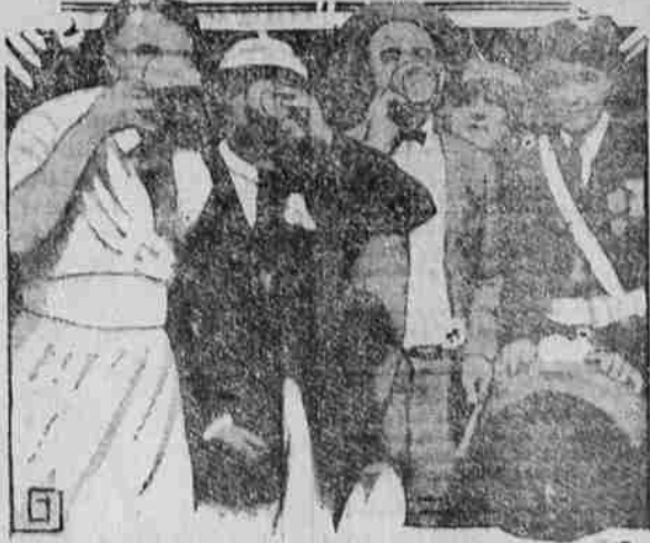
MAYBE IT WAS REAL, and maybe it wasn't, yet Disabled Veterans of the World War enjoyed drinking out of an old time log when they met at Omaha, Neb., for their annual convention.