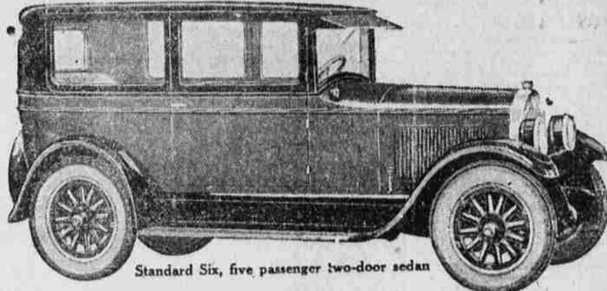
Standard Six, five passenger two-door sedan

Buick, again demonstrated the marvelous resources and abilities of the automotive industry when it introduced the present Better Buick. Embodied in this latest Buick offering are additional power and strength, the newest engineering achievements designed to give even longer motor car life, the maximum in comfort and safety, besides new beauty and refinements of design and finish representing the latest skill in body craftsmanship. And in face of these material and costly improvements lower prices are announced through the entire line of Standard and Master Sixes.