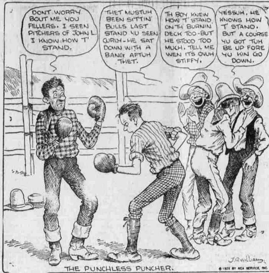
THE PUNCHLESS PUNCHER.