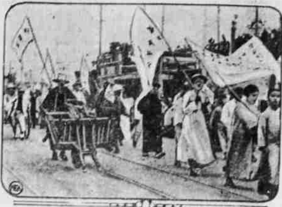
"Kill the British and Japanese" was emblazoned on the banners carried by these Chinese students in Peking. Thousands of them paraded to show their hatred of imperialism and their devotion to China's cause in present trouble there.