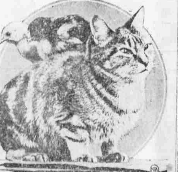
MANY A FAITHY CAT HAS LOST all her nice fees for killing chickens. This one, owned by a family near Burlington, Eng., is different. She has mothered the chicks since they came from their shells. She follows her about during the day, and usually close to her when fur is about.