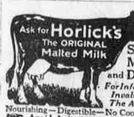
Ask for Horlick's The ORIGINAL Malted Milk Safe Milk and Diet For Infants, Invalids, The Aged Nourishing—Digestible—No Cooking. Avoid Imitations—Substitutes

Flowers grow as far north as land goes, and more than 700 different kinds have been collected in arctic regions.