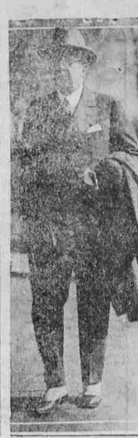
SPATS, CANE, white gloves 'n' everything, but then he is Alanson E. Houghton, the new ambassador to the court of St. James. Picture snapped just after he had called upon the president.

DUBLIN, (AP)—Tuberculosis in the Free State is gradually increasing, statistics show in 1925 in about every 76 of the population was affected by some form of the disease while in 1922 the proportion had diminished to about one in every 50. The decrease in deaths from all forms of tuberculosis in five years was 1,771. In 1923 the tuberculosis death rate was 1.41 per 1,000.