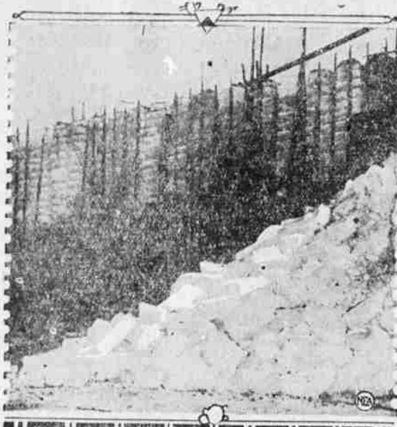
FLAMES COULDN'T BURN the ice when the huge Spy Pond, Ellington, Mass., ice houses were destroyed by fire. Great piles of ice, stored within, seemed to have been left intact.