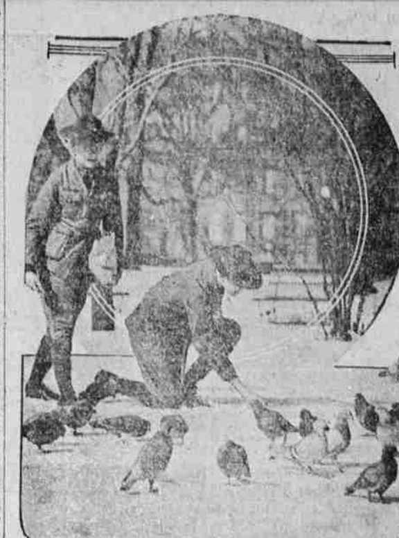
COULD BE JUST "a picture without words," but we will add that Washington Boy Scouts took sole charge of caring for birds in the parks at the national capital during the snow.