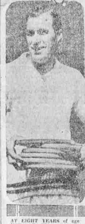
AT EIGHT YEARS of age William T. Tilden not only looked the part of a tennis champion, but he acted it as well by winning a championship cup. Bottom picture, Tilden as he appears today, still a tennis champ.