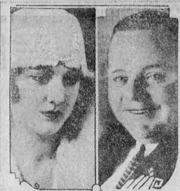
DORRIS DEANE, screen star, and Rosa (Fatty) Arbuckle, ex-comedian who recently figured in a San Francisco murder trial are to wed in the near future, according to reports.