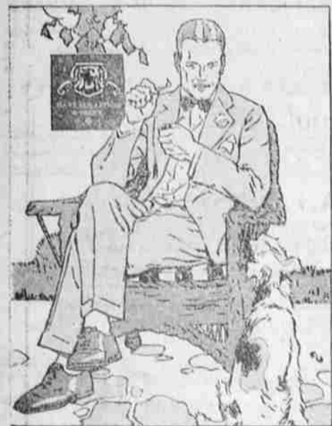
© 1925 Hart Schaffner & Marx

SUITS AT A SAVING Hart Schaffner & Marx, Gold Bond and other well-known makes of men's clothes in a number of prices that will appeal to any man. New styles and patterns that are up-to-the-minute in every detail. There are all colors, and a size to fit you at a saving you'll like.