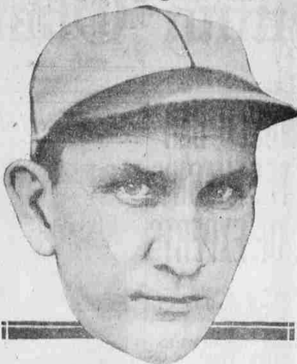
Meet the new manager of the Chicago Cubs. In other words permit us to introduce Mr. "Fabbit" Maranville, long regarded as one of the best infielders in the game. Maranville came to the Cubs in a trade with Pittsburgh last winter. He's been playing professional ball over 15 seasons. He succeeds Bill Killefer, who coached the Cubs since Aug. 4, 1921.