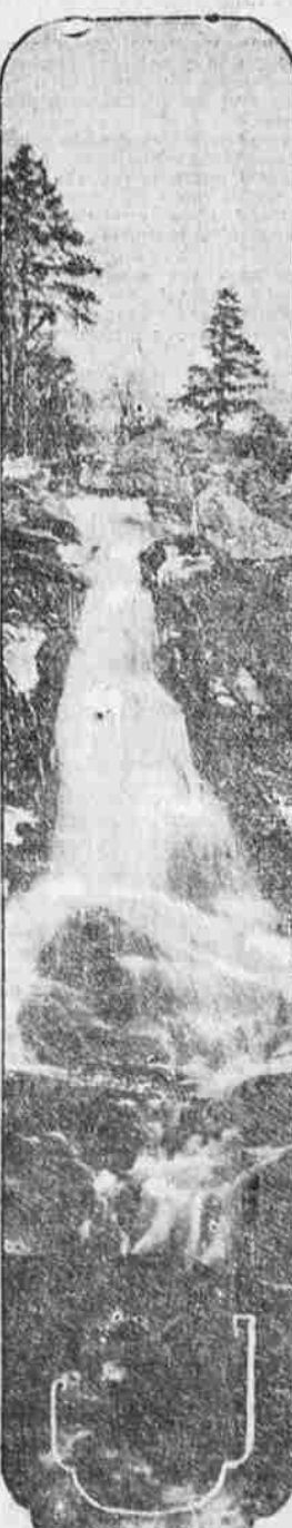
TUMBLING DOWN over precipice after precipice the cool water is churned into a misty spray, but joins itself together again at the bottom, and flows peacefully on over mossy stones to the sea. The falls are in White Oak canyon, British Columbia, Can.