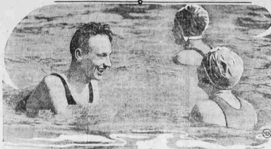
John T. Scopes is going on trial in Dayton, Tenn., on July 16 for teaching evolution, but meanwhile he isn't worrying greatly about it. Here he's shown taking a dip in the old swimming pool near Dayton. And he doesn't have to swim alone, either, you'll note.