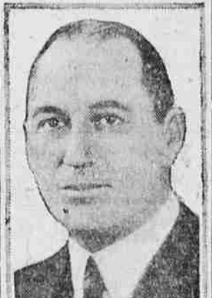
WALTER P. CHRYSLER

His lieutenants insist that a considerable share of the tremendous success the car has created for itself is due to his personal attitude.