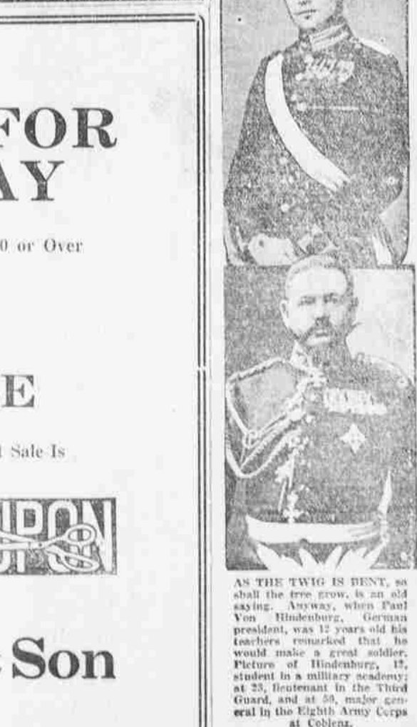
AS THE TWIG IS BENT, so shall the tree grow, is an old saying. Anyway, when Paul Von Hindenburg, German president, was 12 years old his teachers remarked that he would make a great soldier. Picture of Hindenburg, 12, student in a military academy; at 25, lieutenant in the Third Guard, and at 39, major general in the Eighth Army Corps at Coblenz.