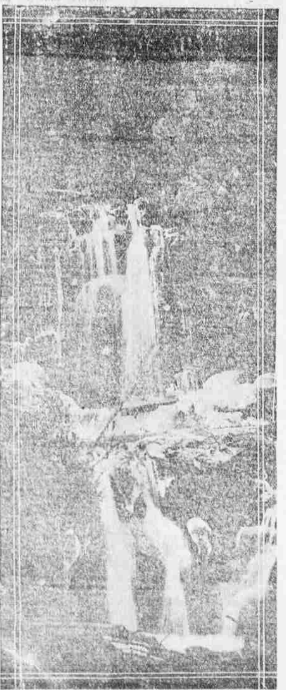
WATERFALLS POSSESS A BEAUTY and an enchantment which is enjoyed by even the least of the artistically inclined. Even savage Indian tribes revered the falls within their hunting grounds, and wove around them many beautiful legends. The falls here are on Doyle's Run, Browns Cove, western Canada.

But the heart of the increase is borne by the Romans who have to pay twice as much, and sometimes three times as much, as last year to maintain their homes. And when explanations are asked, the shopkeepers invariably answer smilingly: "It is the God's Will."