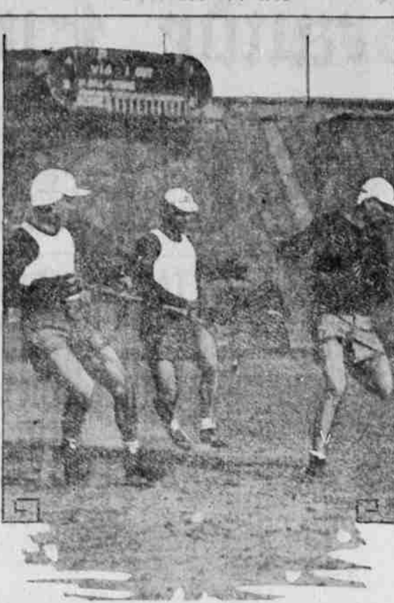
WHEN CORNELL LACROSSE TEAM BEAT PENN STATE, 2-0. The player on the right is just in the act of driving the ball. Lacrosse, though not familiar to a great number of people, is considered one of the best sports in many colleges and universities.