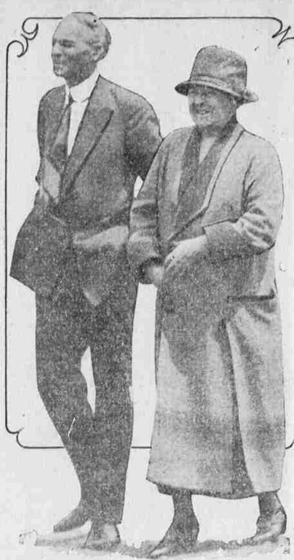
LIKE MRS. COOLIDGE, MRS. HENRY FORD has a smile for all occasions. This picture of Mrs. Ford and her famous husband was snapped on the grounds of the Dearborn plant, Detroit.