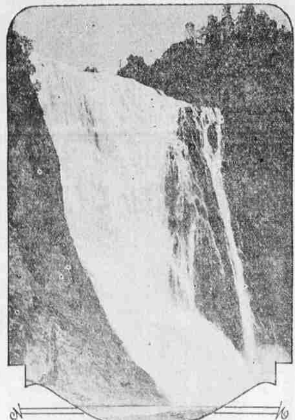
NEAR QUEBEC, CAN., water tumbles over a precipice higher than Niagara, constituting Montmorency Falls, shown here. Kent House, near, was for some time the residence of the governor general of Canada, and during the final siege of Quebec in 1759 the falls protected the left wing of the French army.