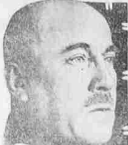
INTRODUCING Colonel Sewell, newly appointed commander of the military forces of Berlin.