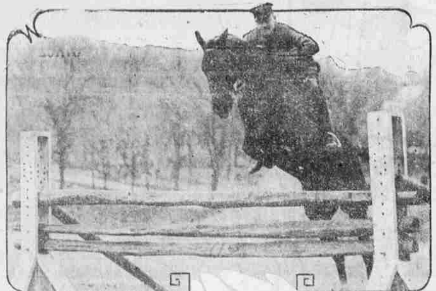
'TIS NOT ALL DANCING, AND FOOTBALL, AND SQUADS RIGHT for cadets at West Point. Horseback riding is a part of the training. Here's a cadet riding the "jump" on the "flac"—one of the stunts every cadet is required to do easily and gracefully.