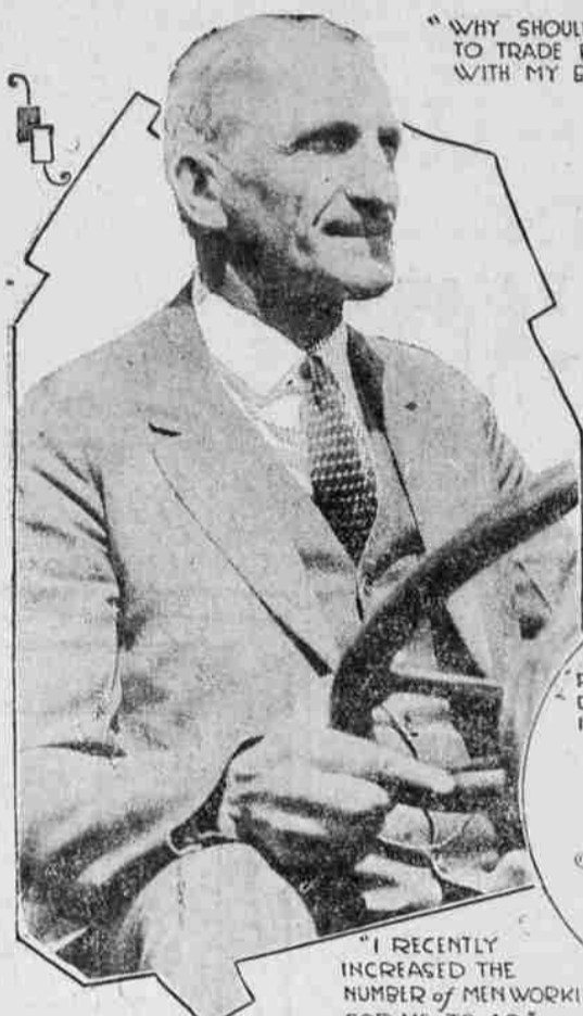
"WHY SHOULD I WANT TO TRADE PLACES WITH MY BROTHER?"