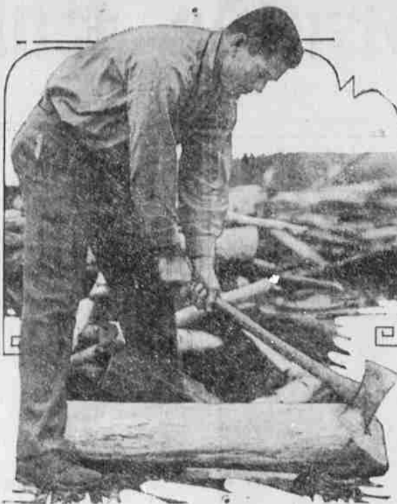
No, this is not one of the hired hands massaging the old wood pile before breakfast. But Gene Tunney, light heavyweight champion in training for his bout with Tommy Gibbons next month, Tunney has mapped out a strenuous training program. Chopping wood is one of the stunts on his list. Photo was snapped at White Sulphur Springs N. Y., his training headquarters.