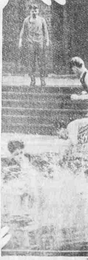
When freshmen at Western Reserve University, Cleveland, O., kidnap two sophomores and made them wash the face of a statue at the pond building, they started something. The sophomores herded a number freshmen to a park lagoon.