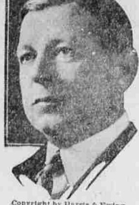
Dwight F. Davis of St. Louis, assistant secretary of war, may succeed his chief, if the latter resigns.