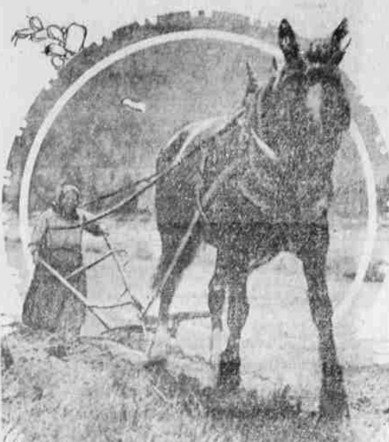
SPRING IS HERE and it will soon be planting time. So this Dalhousie woman of British Columbia, Calif., hitched old Dolly to the plow and begins making ready for seed bed.