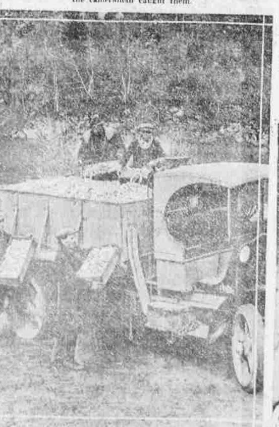
IN JUST 45 MINUTES five amateur fishermen caught a truck-load of smelt in the Sandy River, near Portland, Ore. When the smelt take a notion that it is time to run up to the spawning grounds, the river is literally filled with them. Then the entire countryside goes fishing.