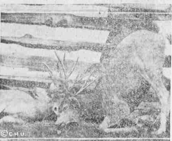
END OF A CHAMPIONSHIP BATTLE HERE. Two buck deer began a fight to death for the supremacy of the herd near Klamath Falls, Ore. Their horns got locked and, when found several days later, one was dead from exhaustion and starvation and the other was so weak he could hardly stand.