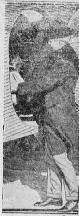
(Left) Henry Ford helping to load freight on the "Maiden Dearborn," which inaugurated the Ford Air Freight line in a flight from Detroit to Chicago. (Right) The Maiden Dearborn, all-metal plane of the Ford Air Freight line as it looked after taking the air on the first flight from Detroit to Chicago.