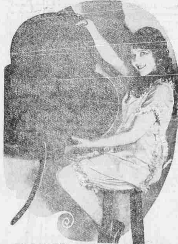
"TOP O' THE MORNING TO YOU," says this young Irish maid as she steps out on the morning of March 17. Mary Pickford, of course, 'tis none other, and she's proud of all her Irish blood.