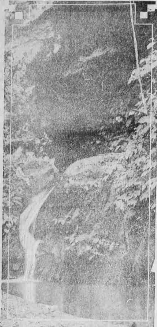
OUT OF THE DUNGEON-LIKE BLACKNESS of this cave at Selous, Ceylon, in the Philippine Islands, trickles a small waterfall that is said to have marvelous health-giving properties. Its source never has been discovered.