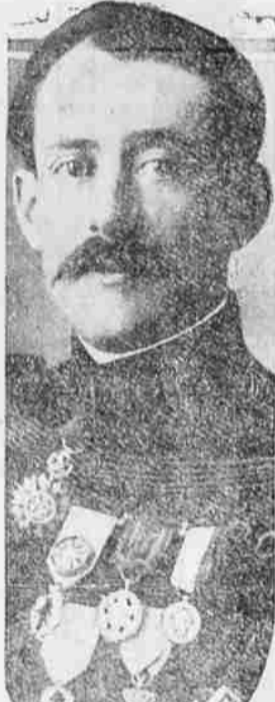
M. MAURICE BEYGRASSE, governor general of Malawi, leading African archaeologist, will accompany a Beloit College, Beloit, Wis., expedition into northern Africa next summer in search of the cradle of pre-historic civilization.