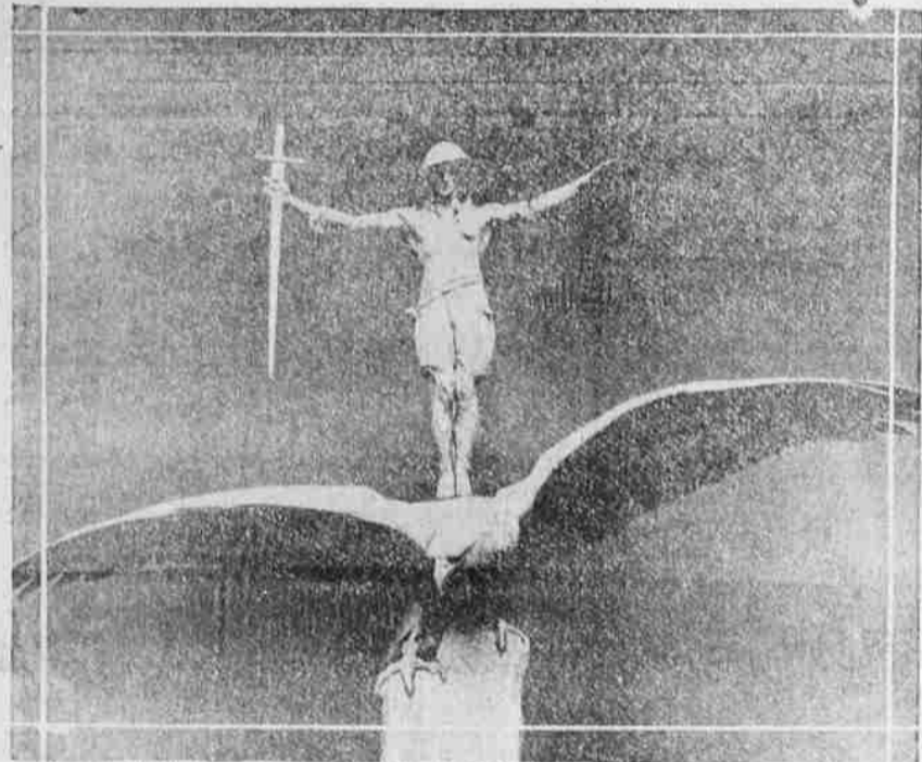
ON A ROCK JETTING 60 FEET OUT OF THE WATER in the harbor of St. Nazaire, France, will be placed this memorial statue commemorating the first landing of American soldiers in France on June 26, 1917. The statue, designed by Mrs. Harry Payne Whitney, shows an American soldier astride a spread eagle, and armed with a crusader's sword.