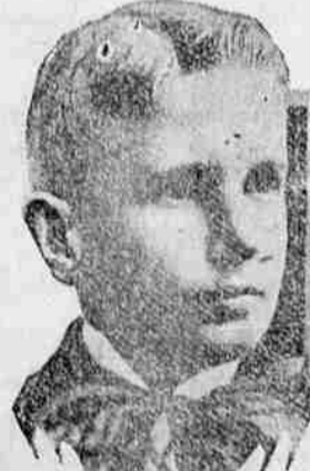
ABOUT THE AGE when this picture was made, 10, Burton K. Wheeler's mother told him he'd grow up to be president. Well, he's now United States senator from Montana. Never can tell.