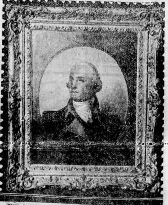
THIS FAMOUS PAINTING of George Washington by Peale has been purchased by Daughters of the American Revolution, and will be hung in the Continental Memorial Hall at Washington.