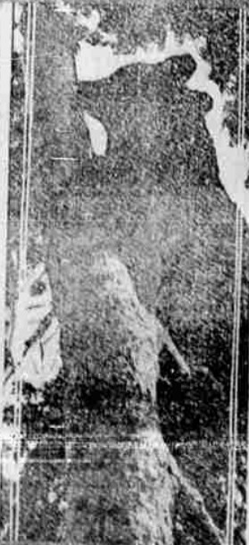
NEVER CLIMB A TREE when a bear chases you. The old saying that bears can't climb trees is all wrong. Look at the picture. Bruin is going right up. It's a Glacier National Park bear.