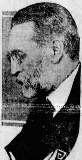
HERE WE HAVE Chief Justice George Sutherland. He is 62 years old, and was appointed to the bench by President Harding, Sept. 4, 1922.