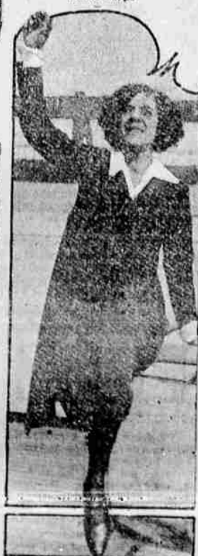
PSYCHOLOGISTS are unable to account for Ethel Leginska, internationally famous woman pianist. Miss Leginska mysteriously disappeared just before a scheduled concert in New York, and was completely lost to the world until she was found in the outskirts of Pittsburgh a few days later.