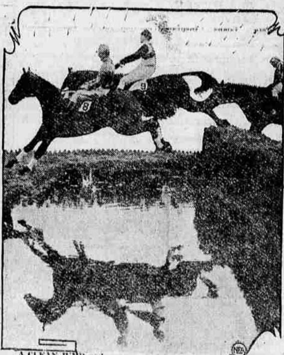
A CLEAN JUMP , and an unusual picture of the horse's shadow, reflected in the water. Picture at a handicap steeple chase, Kenton Park, England.