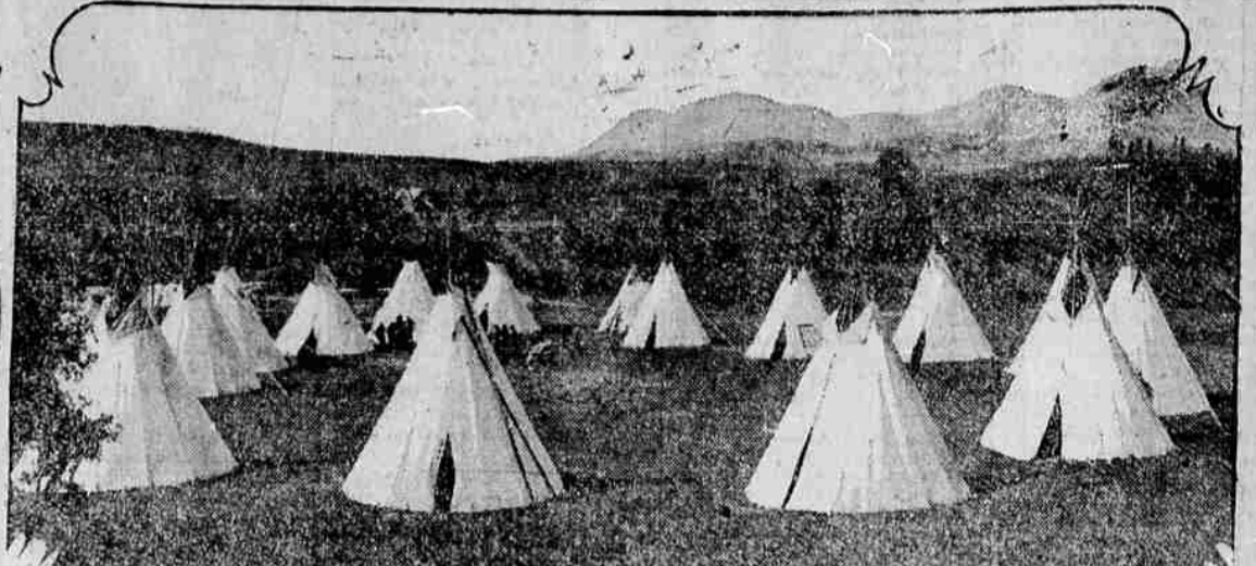
UNCLE SAM FEEL that he owed the Blackfoot Indians something for the 1500 square miles now Glacier National Park, so this Teepee town is maintained at the gateway in commemoration of the gift. The land once was the best of the tribe's hunting ground.