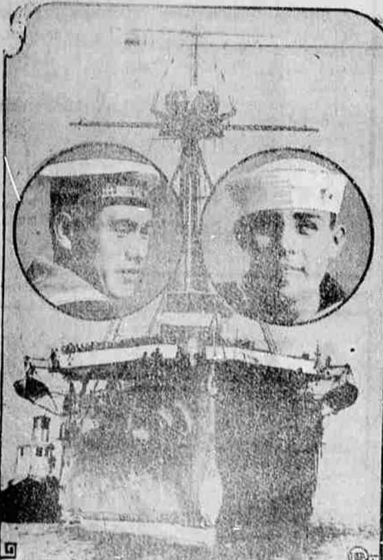
WHILE JINGDES RANT of a possible war between Japan and the United States, San Francisco and American jockies are trying to show the Japanese that they, at least, are friendly. Jap warship "Izumo" in San Francisco harbor, and an American sailor fraternizing with a Jap.