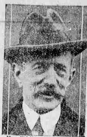
M. JULES JUSSERAND'S successor as ambassador from France, Emile Darschner, Daeschner talked with Coolidge the other day and agreed that "nations should pay their debts."