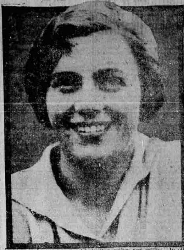
Here's a well known sport celebrity in a rather new setting. In other words, we present Miss Glenna Collett, former women's national golf champion as she appears off the links at Ormond Beach, Fla. Glenna is preparing for a British invasion and is wearing the same winning smile it would appear.