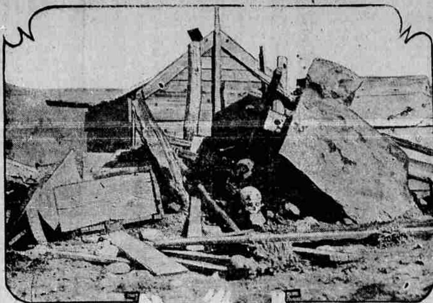
THE GREAT FATHER did not respect this Blackfoot Indian chief's tomb in Glacier National Park. The rough board coffins were blown off their canopied mound and the bone remains of the braves ruthlessly strewn about.