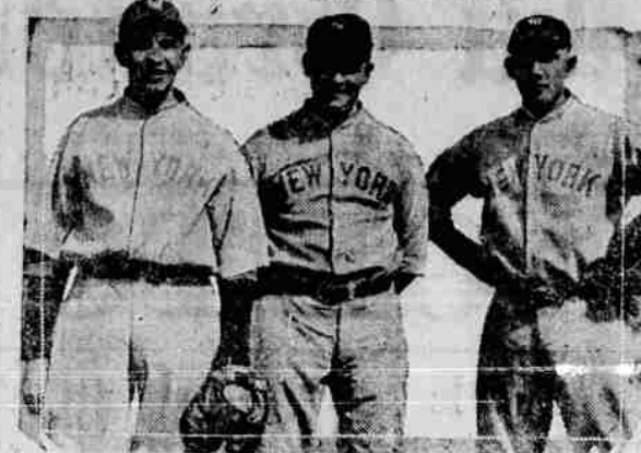
Here are three "straightaway" pitchers with the New York Yankees, now in training at St. Petersburg, Fla. They are Waite Hoyt, Sam Jones and Bob Shawkey, shown in the above photo from left to right in the order named. Manager Huggins expects much from the trio this season.