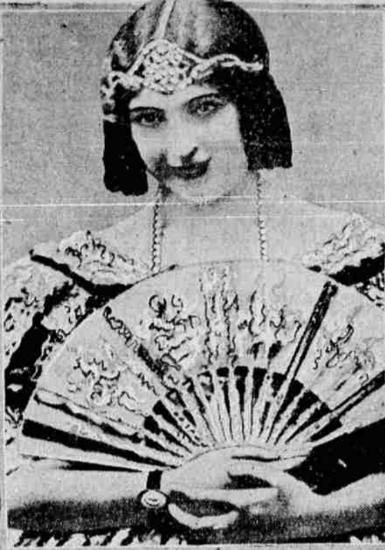
Carmen Ruiz de Moragas, Spain's most prominent stage star, heir to over $7,000,000, has started all Europe. While visiting in Mexico she fell in love with Redolfo Gaona, a matador. He followed her to Spain and later she left home to join him. They were arrested, but are expected to be permitted to marry soon—which they want to do.