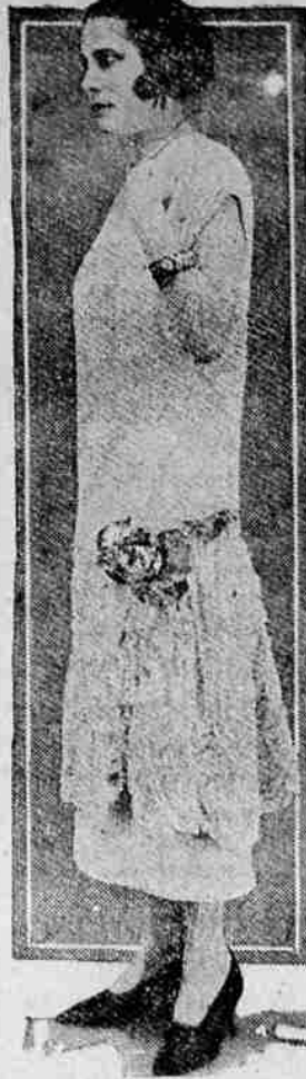
THIS new Paris dress won't be for the flapper who is not averse to "a kiss in the dark." A large phosphorescent flower, just below the waistline, is its only decoration.