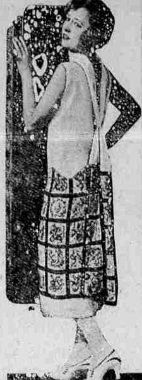
This very feminine frock is in white crepe handblocked in rose shades and a black lattice work. The gown which is drawn closely about the neck in front reveals a deep V in the back and the long ends extend to the hemline.