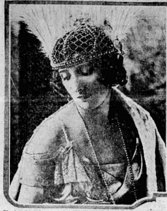
The best-dressed woman—is what French critics say of Countess Shammoun, one of the well-known personalities, whose wardrobe is said to be very extensive.