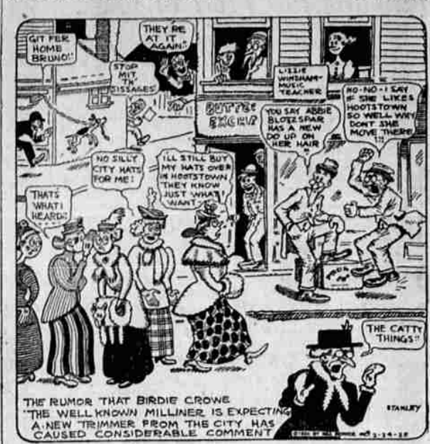
THE RUMOR THAT BIRDIE CROWE THE WELL KNOWN MILLINER IS EXPECTING A NEW TRIMMER FROM THE CITY HAS CAUSED CONSIDERABLE COMMENT