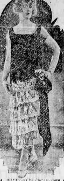
A SUMPTUOUS dinner gown of black chiffon with an entire overwork of exquisite lace is this new creation.