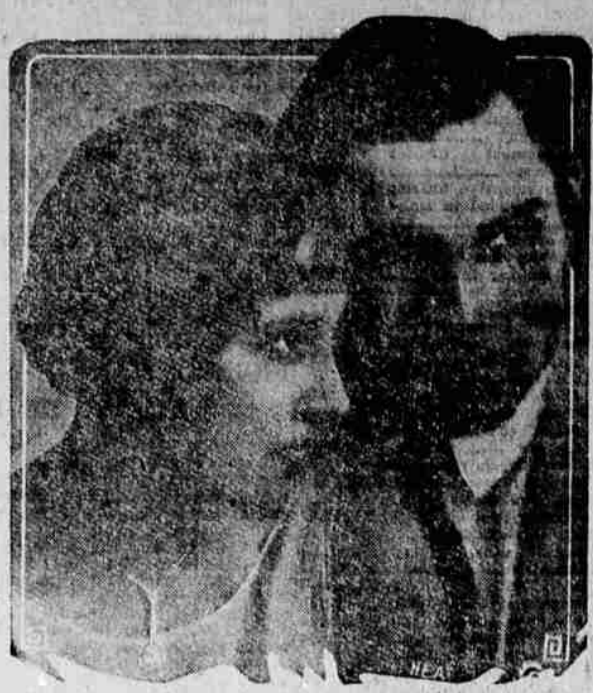
After the whole world has suspected it of them for months Jack Dempsey, who is a prize-fighter by profession, and Estelle Taylor, known best for her movie career, finally admit they are to be married. When? Soon. Here they are posed for the "announcement" picture.