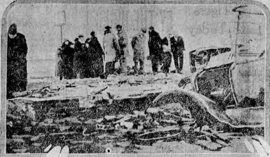
Smoldering ruins of the Robert G. Kelly school are mute evidence of the Christmas Eve tragedy which caused the death of more than 100 persons when the building burned to the ground. A Christmas candle tipped over as Santa delivered his presents to little children, causing the blaze. Above shows relatives and friends searching the ruins for the bodies of their loved ones.