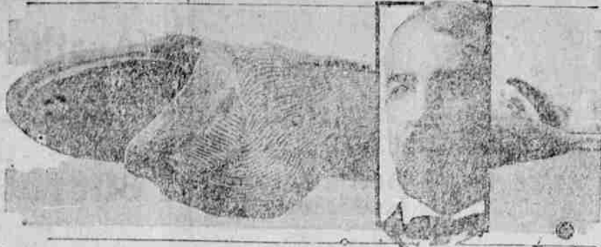
This is the sort of whale that swallowed Jonah. It is a sperm whale, and is the largest of all whales. It is found in the North Atlantic and is known for its ability to swallow large objects, including people.