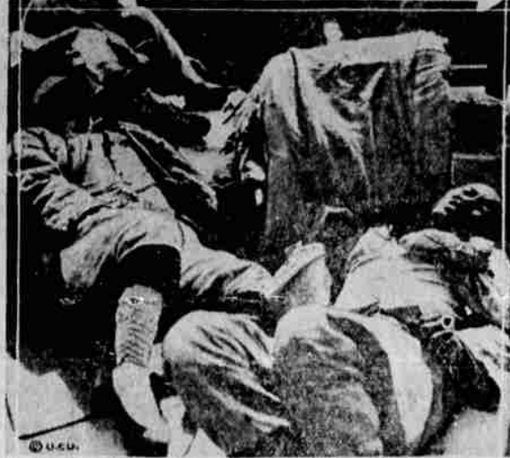
These Chinese national soldiers, wounded on the Shanghai front, are at a railway station awaiting transfer to a base hospital. They were fighting under the command of Marshal Wu Pei Fu against the Manchurian invasion of the Fengtien troops.