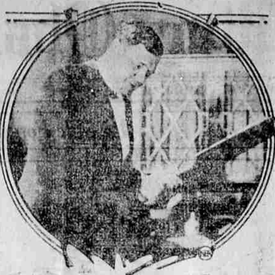
The left-handed Babe Ruth a cricket stick the other day and the man who made home running an art in this country took a preliminary swing with the chief offensive weapon of England's favorite sport. "It might be all right to use in spite of the comedy," commented the Babe. "But I'd hate to hit against Walter Johnson with it."