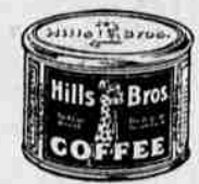
In the Original Vacuum-Pack which keeps the coffee fresh.