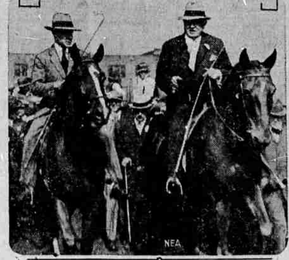
The Prince of Wales may have difficulty remaining astride a horse back in Great Britain—but during his visit to the Chicago stock yards Edward David Windsor showed them he could stick on. The man on the prince's right is Louis F. Swift, whose guest the prince was during his 17-hour stay in Chicago.