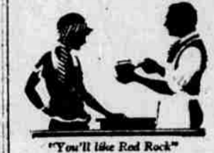
"You'll like Red Rock"

A regular advertiser is a de- pendable merchandiser.