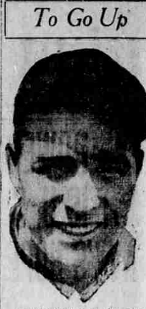
"Lefty" O'Doul, of the Coast League, who expects to get another chance in the big time next year.

anything that resembles an easy game, is as follows: Oct. 4—Gonzaga at Spokane, Oct. 11—Montana at Missoula, Oct. 18—Washington State at Moscow, Oct. 25—Stanford at Portland, Oct. 31—Oregon Aggies at Corvallis, Nov. 3—Oregon at Moscow, Nov. 22—Southern California at Los Angeles, Nov. 27—Nevada at Boise.