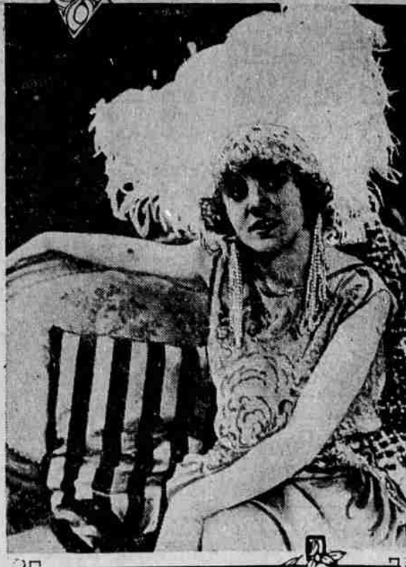
When Pola Negri left Europe to make pictures in America, Ossi Oswalda, beautiful German film star, took her place in the hearts of European movie fans. Now Ossi may be the next foreign film star to invade America.